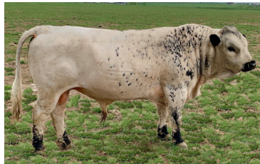
Pointer Ridge Buck

It is imperative that a herd sire has these traits to pass on to their offspring. When you sell a registered bull or bull calf, your farm name goes with him - along with your reputation as a breeder. Our goal is to further the quality of the White Dexter Breed! For more information on bull conformation, please click here .